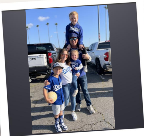
Dodgers Game 2024